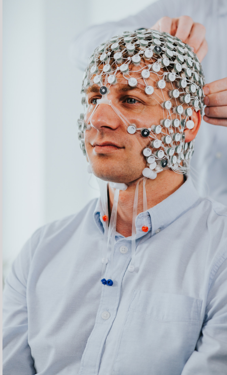
Model Displayed is Desktop Version of GES 500